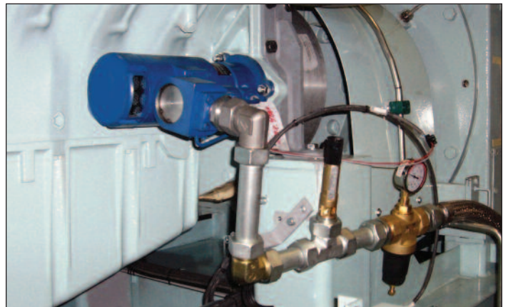
T25 installed on a MAN D2842

The TurboTwin brand has the distinction of having the most turbine air starters in the field, and the most turbine air starters operating in the world's harshest and most demanding environments. There is a reason TurboTwin is the number one choice of system integrators, packagers, and aftermarket end users – "unparalleled starting reliability."